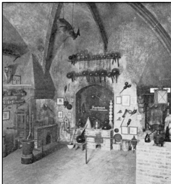
Figure 5. Photo of the alchemist's laboratory in the Deutsches Museum which was almost certainly the basis of the Dorn painting in figure 2.