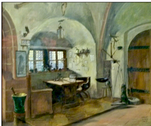
Figure 1. Painting by Ernst Dorn of a reconstruction of an alchemist's study in the Deutsches Museum, circa 1925.

The two paintings – one of an alchemist's study (figure 1) and the other of an alchemist's laboratory (figure 2) – were originally part of a set of 10 paintings and vignettes done by Dorn to illustrate an article on the displays relating to the early history of chemistry found in the newly completed building of the Deut-