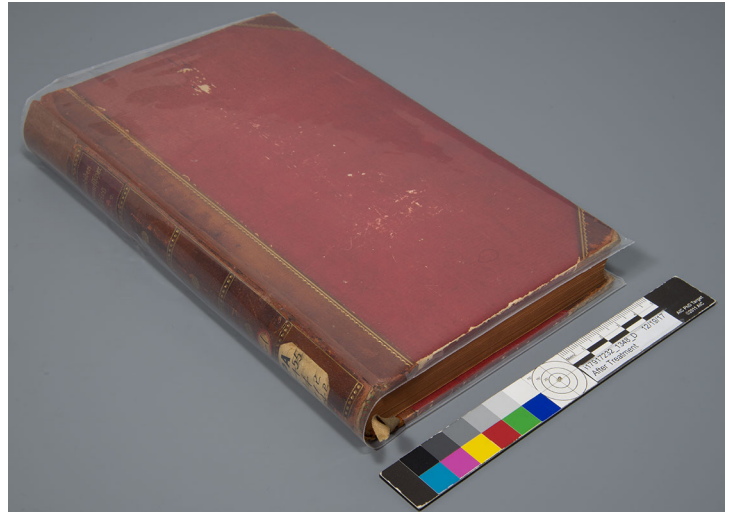
i17817232_1348_D01N - After treatment