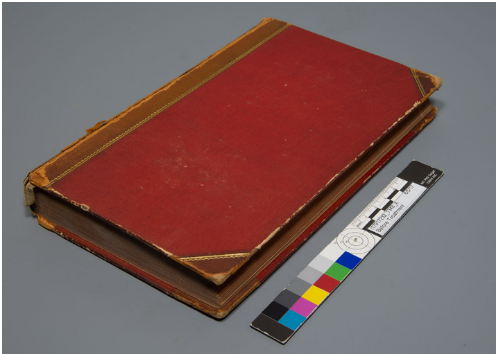
i17817232_1348_A02N - Before treatment