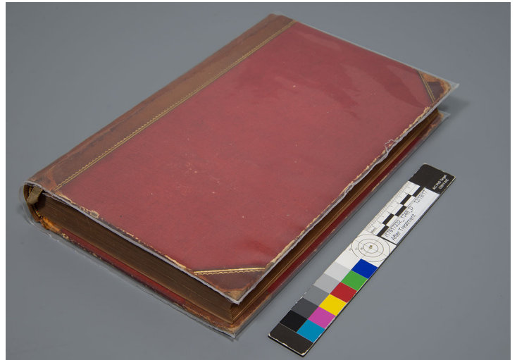
i17817232_1348_D02N - After treatment