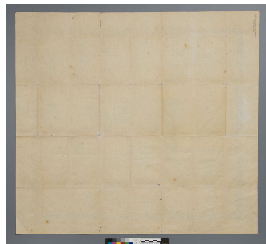
i10377918_1256_D02N After Treatment