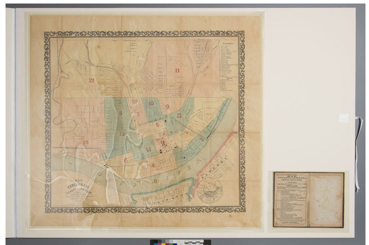
i10377918_1256_D04N After Treatment - New housing - Polyester sleeve