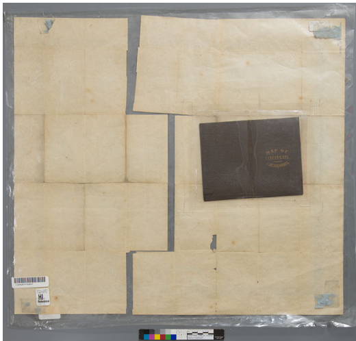
i10377918_1256_A02N Before Treatment