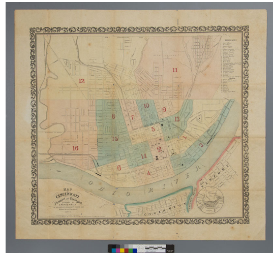
i10377918_1256_D01N After Treatment - tears mended