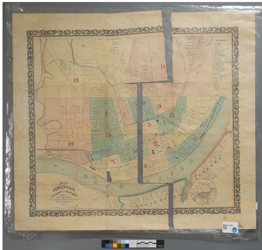
i10377918_1256_A01N Before Treatment - Torn map