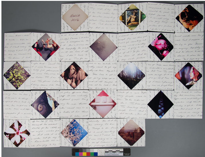
i88877644_1246_A01N - Unfolded, recto