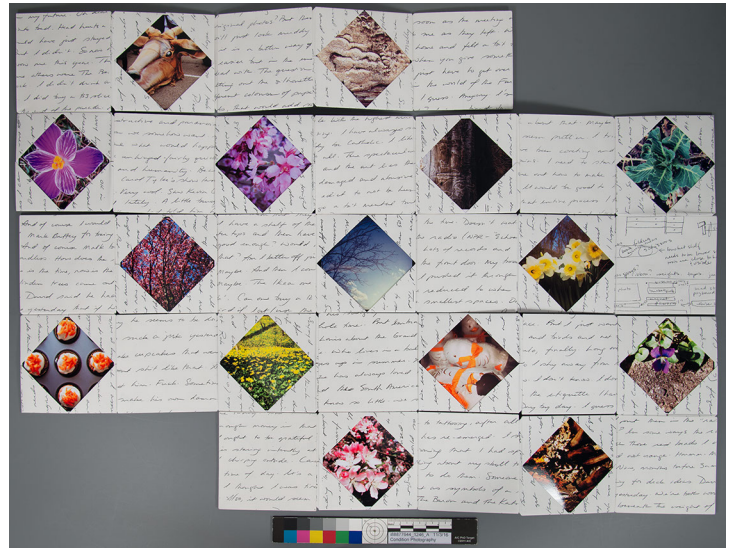
i88877644_1246_A02N - Unfolded, verso