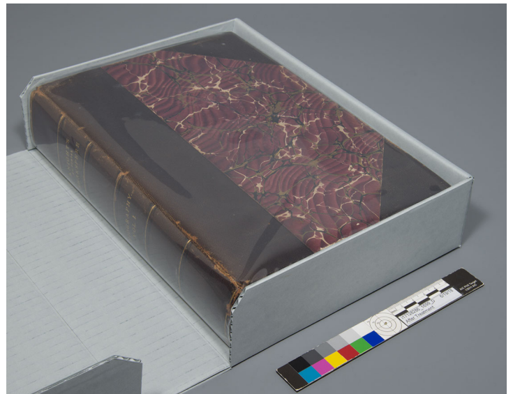
i17128286_1699_D01N - After treatment and housing