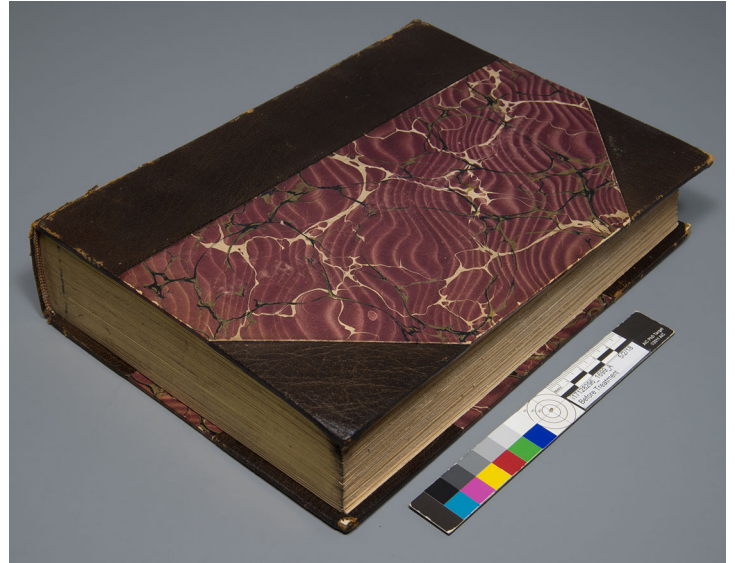
i17128286_1699_A01N - Before treatment and housing