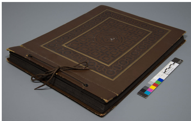
i91034139_1430_A01N - Before treatment