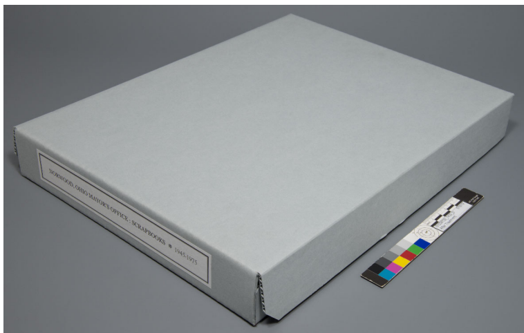
i91034139_1430_D05N - After treatment, scrapbook housed in corrugated clamshell enclosure