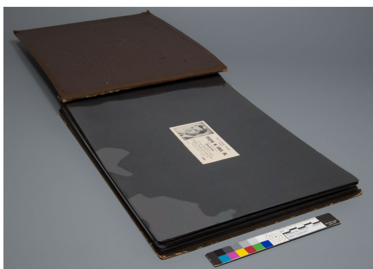
i91034139_1430_D03N - After treatment