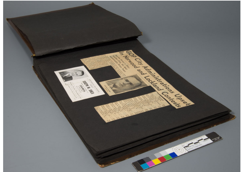
i91034139_1430_A04N - Before treatment