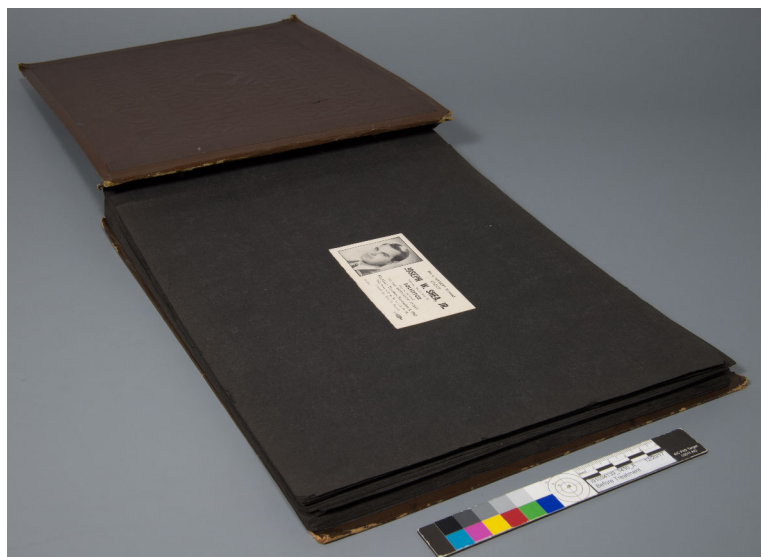
i91034139_1430_A03N - Before treatment