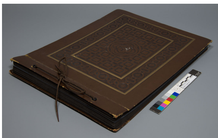
i91034139_1430_D01N - After treatment